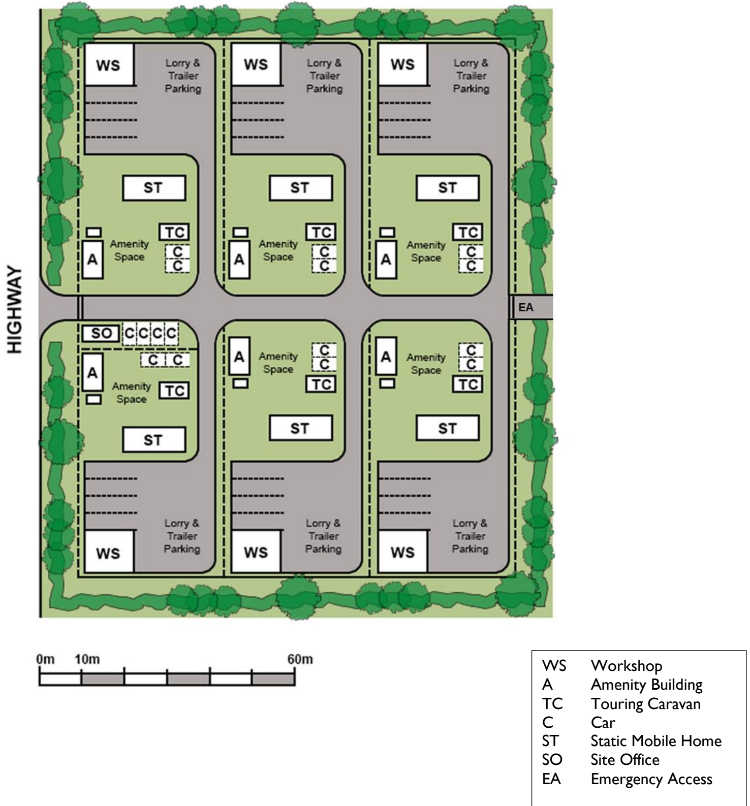
Figure 1: Indicative Travelling Showperson site example layout with separate provisions